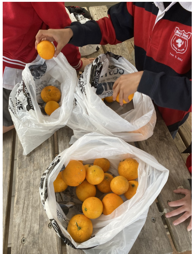
Gold coin donation for oranges.